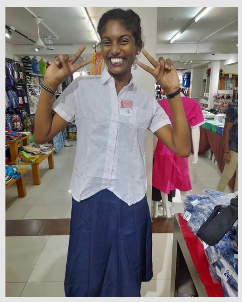
64 Girls received uniforms, shoes and bags